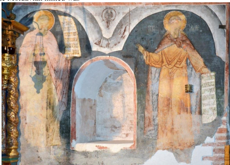
5. St. Nicolas, Popăuți, southern wall of the eastern bay of the naos.

Prodrome, on the southern wall. The large, opened scroll that he grasps might suggest, while waiting for the restorer's intervention, that yet another prophet stands in front of the three eremites. A similar paralleling, on the threshold of the apse, of saintly monks with ascetic exempla taken from the Bible is noticed even earlier at Popăuți (1496) 15 , where two unidentified monks, on the northern wall, are mirrored by Elijah and Elisha ( fig. 5 ); most significantly, the rolls displayed by the prophets address the issue of spiritual filiation and its charismatic strength (a rather monastic concern). 'And Elijah said: Elisha, you stay here, the Lord is only sending me to the Jordan' (2 Kings, 2: 6); Elisha has the spiritual clairvoyance to disobey this command, and this will grant him the fulfilment of a bold request: 'And Elisha said: Let me inherit a double share of your spirit' (2 Kings, 2: 9). The Moldavian milieu was