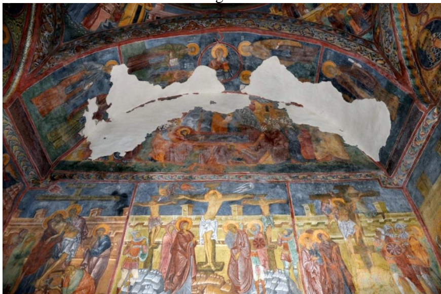
3. Holy Cross, Pătrăuți, western bay of the naos.

Another display of monks in the western bay of the naos takes place at Pătrăuți (before 1496) 10 ; in this case their insertion is prompted by the depiction of the Dormition of the Virgin in