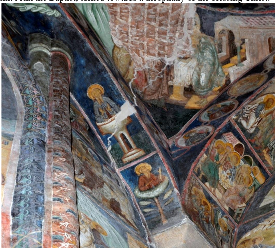
4. Beheading of St. John the Baptist, Arbore, western segment of the southern arch of the naos. Until a much needed cleansing of the frescoes, one could not advance any hypothesis concerning the identity of the other saint associated with the

The presence of the saintly monks in the iconography of the naos extends towards the eastern areas at Dorohoi (1522-1525) 14 , where saints Euthymius and Stephen the Younger partake to the choir of martyrs in the western half of the northern apse, while three more monks (among whom only Anthony could be ascertained by his name inscription) stand on the northern wall of the eastern bay, in front of the sanctuary, opposite to another ascetic model, saint John the Baptist, turned towards a theophany of the blessing Christ.