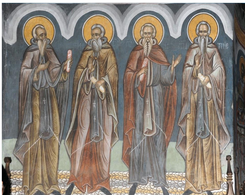
2. Moldovița monastery, northern wall in the western bay of the naos.

naos, alongside saints Theodore Stratelates and Demetrius, a whole group of monks: Stephen the Younger – the Iconophile confessor –, John Climacus, Euthymius – in the company of two other unidentified monks –, Anthony, Theodosius the Coenobiarch, Arsenius, Sabbas, Cyriacus and Onouphius 5 . On the same island, in the second decade of the 16 th century, at Palaiochoro, a similar strategy brings forth, at the western confines of the naos, the portraits of Athanasius the Athonite, Sabbas, Theodosius the Coenobiarch, Arsenius, Hilarion and Onouphius 6 . These examples are consistent with a practice attested at Moldovița (1537) 7 , where the monks build up