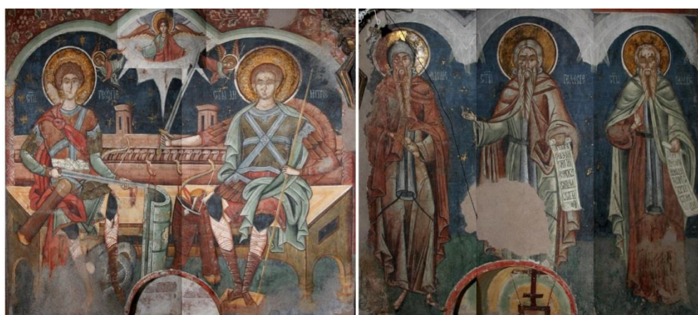
1. St. Nicolas, Bălinești, walls of the eastern bay of the naos. Sts George and Demetrius (N), Sts Anthony, Gelasius and Palladius (S).

Nevertheless, several Moldavian post-byzantine monuments display a surprising integration of the ascetic saints in the program of the eastern bay of the naos (fig. 1); placed on the threshold of the sanctuary, the monks join the choir of martyrs – alluding therefore to a possible parallel between martyrdom and ascetic life, a theme which could be traced back to theological writings underpinning the byzantine approach to monastic seclusion. This peculiar iconographic option should be considered, however, in the broader context of the ‘monastic participation’ to the iconography of the naos in general, in search of a comparison with late Byzantine parallels 4 and of an overall taxonomy for such an infrequent selection of the sanctoral displayed in a space governed by the Eucharistic liturgy.